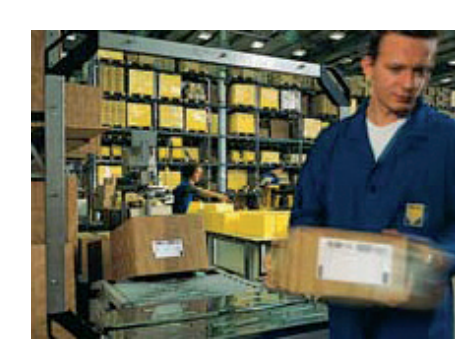
Manual Postal sorting