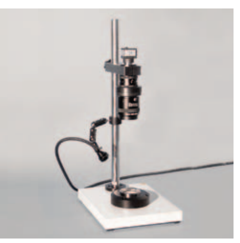
Compact setup for biomedical samples with transmitted light base