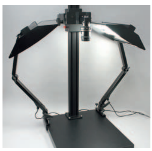
Varible lens perfect for documentation of big samples with incident illumination