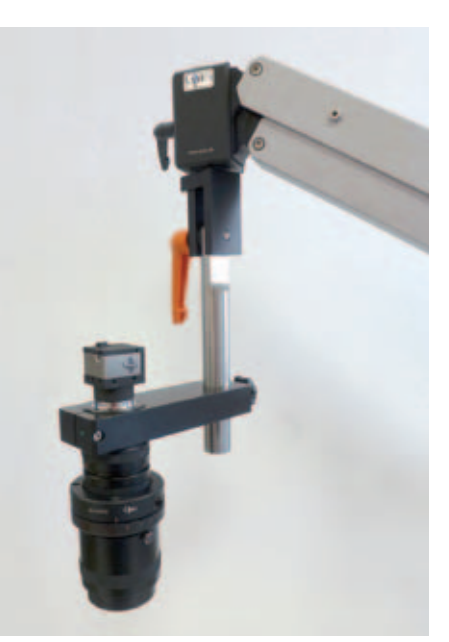
Macro and Micro imaging combined in one lens - detents for repeatable measurements