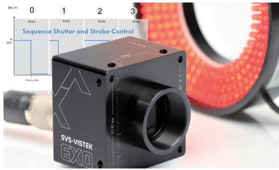
Features with real value: Power your LED light directly from the EXO series and use it as an innovative strobe controller.

With the EXO series SVS-VISTEK is proud to announce the built-in 4io-interface. A truly powerful feature that allows up to 4 LED illumination sources to be individually driven and controlled. Imagine the savings in cost and effort working with one standard SDK brings. A true workhorse ready to meet a wide variety of needs. A robust camera at a reasonable cost level. Bringing together a wide range of the latest CCD and CMOS sensors in uniform housing concept. Easy to integrate, thanks to the use of standardized connectors and pin-outs across all series. Backed up by industry standard digital video interfaces. Physical size is not the only parameter for measuring performance.